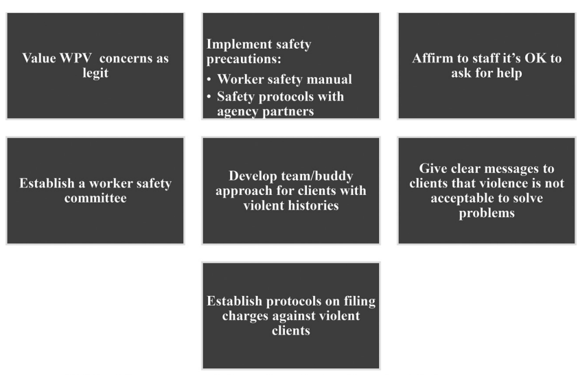
** Editorial note: content in boxes from citation; figure is original