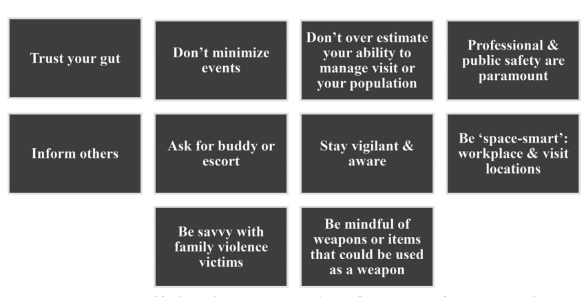
**Editorial note: content in boxes from citation; figure is original.

The OSHA (2015) details risk factors endemic to health care organizations, which are presented in Figure 1. In the effort to further assist those organizations to better prevent and address violence in their work spaces, The Joint Commission released a new Sentinel Event Alert in April 2018 to inform about physical and verbal violence against health care workers. As the entity responsible for accrediting and certifying health care organizations and programs in the United States, The Joint Commission took an especially strong stance. From its vantage, every episode of violence or credible threat to health care workers warrants notification to leadership, internal security, and as needed law enforcement. Incident reports should be completed to analyze the events and inform actions to be undertaken. The numbers continue to be alarming, with 75% of aggravated assaults and 93% of all assaults against health care workers attributed to clients or customers of the organization. The sentinel alert affirms that no health professional is immune from either physical or