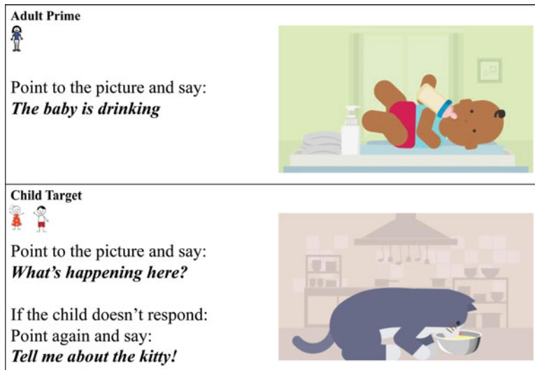
Figure 1. Sample item set. The adult prime and child target slides are shown separately. For each item pair, the adult prime sentence and animation are displayed first. Then the examiner turns the page to display the prompts and child target animation. This figure is available in color online ( www.topicsinlanguagedisorders.com ).

child's attention to the task, the parent is instructed to follow the script that appears on the screen via screen share. After describing the task, the examiner guides the parent through two practice items and then begins the task.