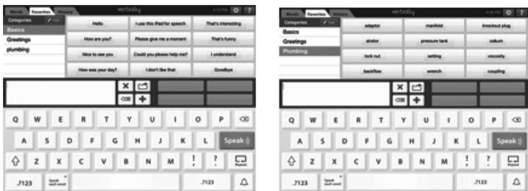
Figure 1. An example of a custom high-tech augmentative and alternative communication display created to support an adolescent communicator with some orthographic knowledge and particular interests. This display corresponds to the case of Anthony, who uses a combination of a keyboard and grid display with preprogrammed phrases (image on left) and frequently communicated, personally relevant words (image on right).

Augmentative and alternative communication technology also has supported Anthony’s building of narrative skills. When given photograph and video prompts related to his interest in plumbing from his SLP, Anthony